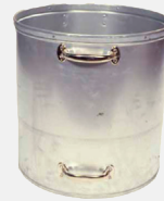
Optional steel container for safe handling of, for example, tins and glass after compaction.