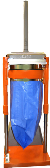
Emptying height 2660 mm is standard

It is easy to feed material into the the open top-loading unit. The compactor is safe and simple to maneuver and the built-in hoisting function makes the bag switch fast and convenient