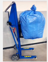
A simple-to-use option – the Orwak bale/bag lifter. Eliminates manual heavy lifting.